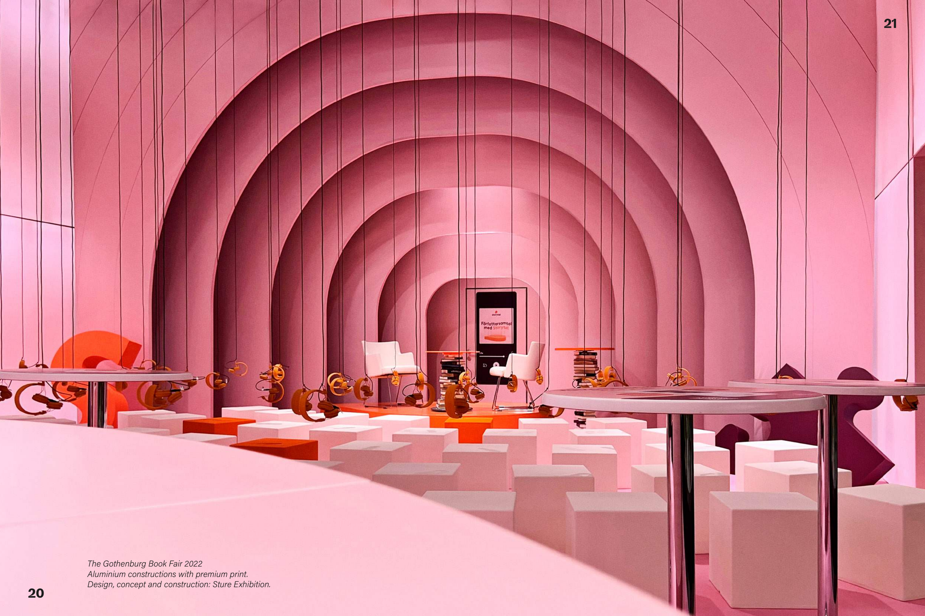
The Gothenburg Book Fair 2022 Aluminium constructions with premium print. Design, concept and construction: Sture Exhibition.