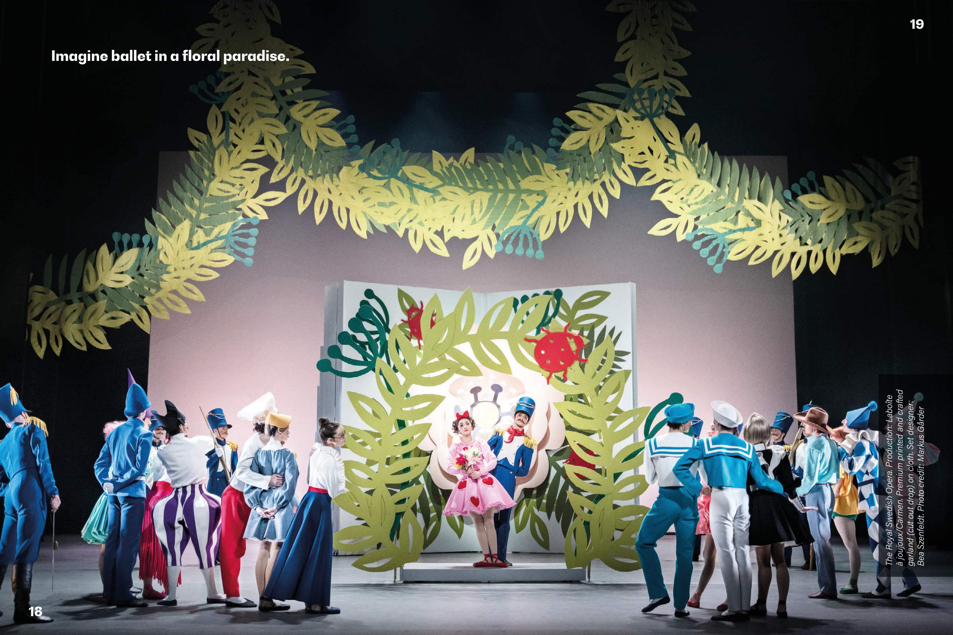
The Royal Swedish Opera. Production: Laboïte à joujou/Carmen. Premium printed and crafted garland (cut out drop) on cloth. Set designer: Bea Szenfeldt.