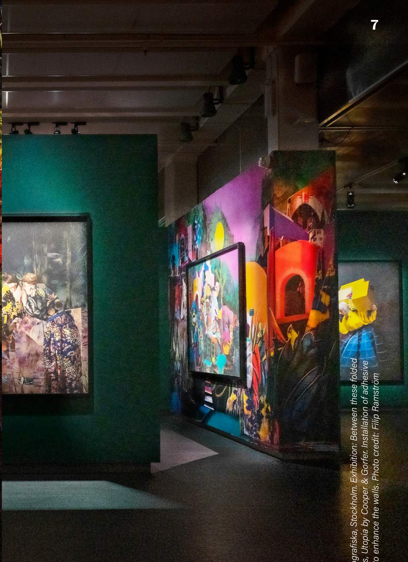
Fotografiska, Stockholm. Exhibition: Between these folded walls, Utopia by Cooper & Gorfer. Installation of adhesive foil to enhance the walls.