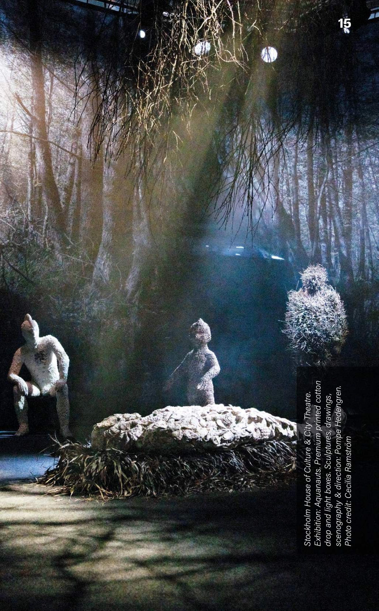
Stockholm House of Culture & City Theatre. Exhibition: Aquanauts. Premium printed cotton drop and light boxes. Sculptures, drawings, scenography & direction: Pompe Hedengren.