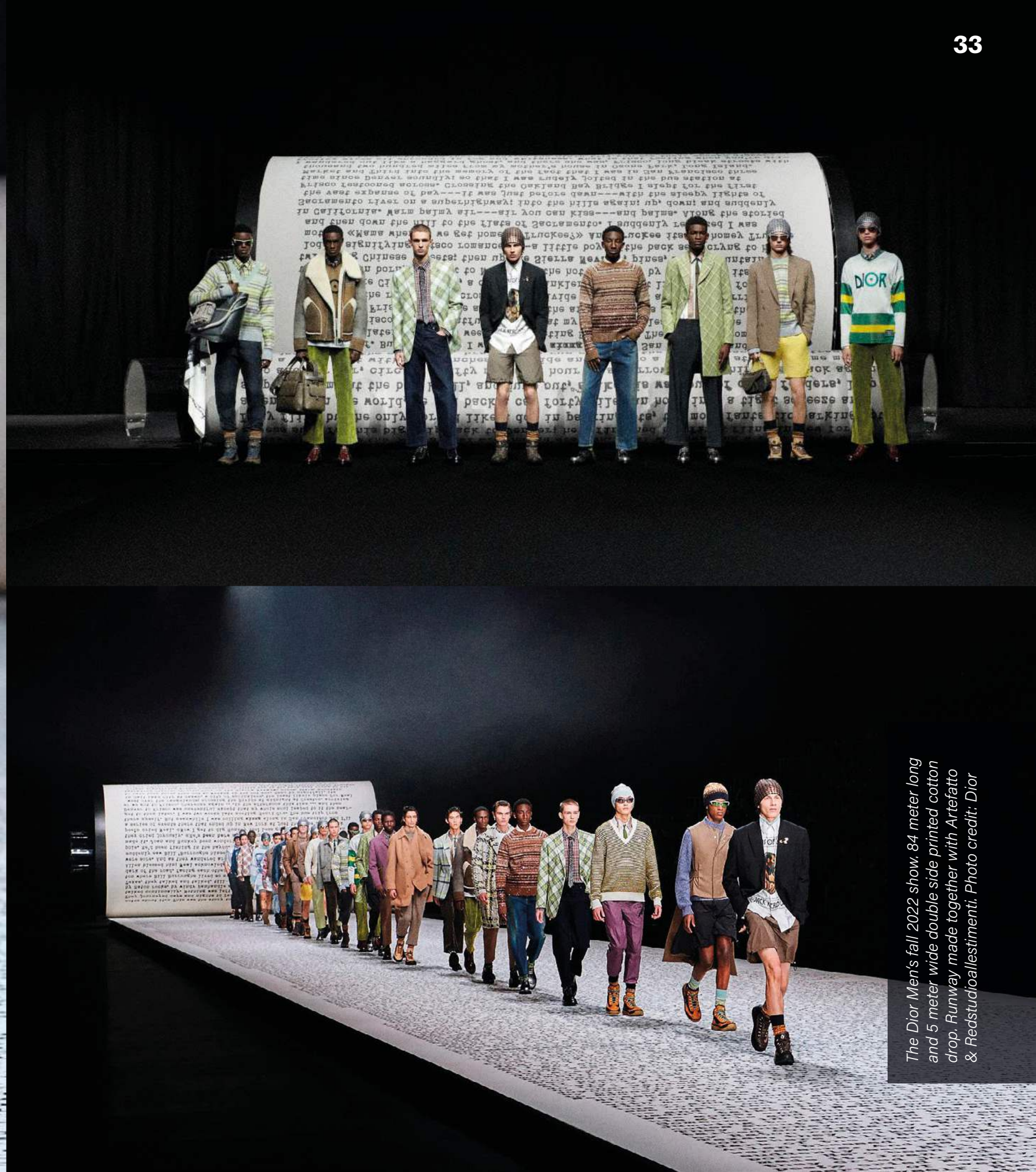
The Dior Men's fall 2022 show. 84 meter long and 5 meter wide double side printed cotton drop. Runway made together with Artefatto & Redstudioallegamenti.