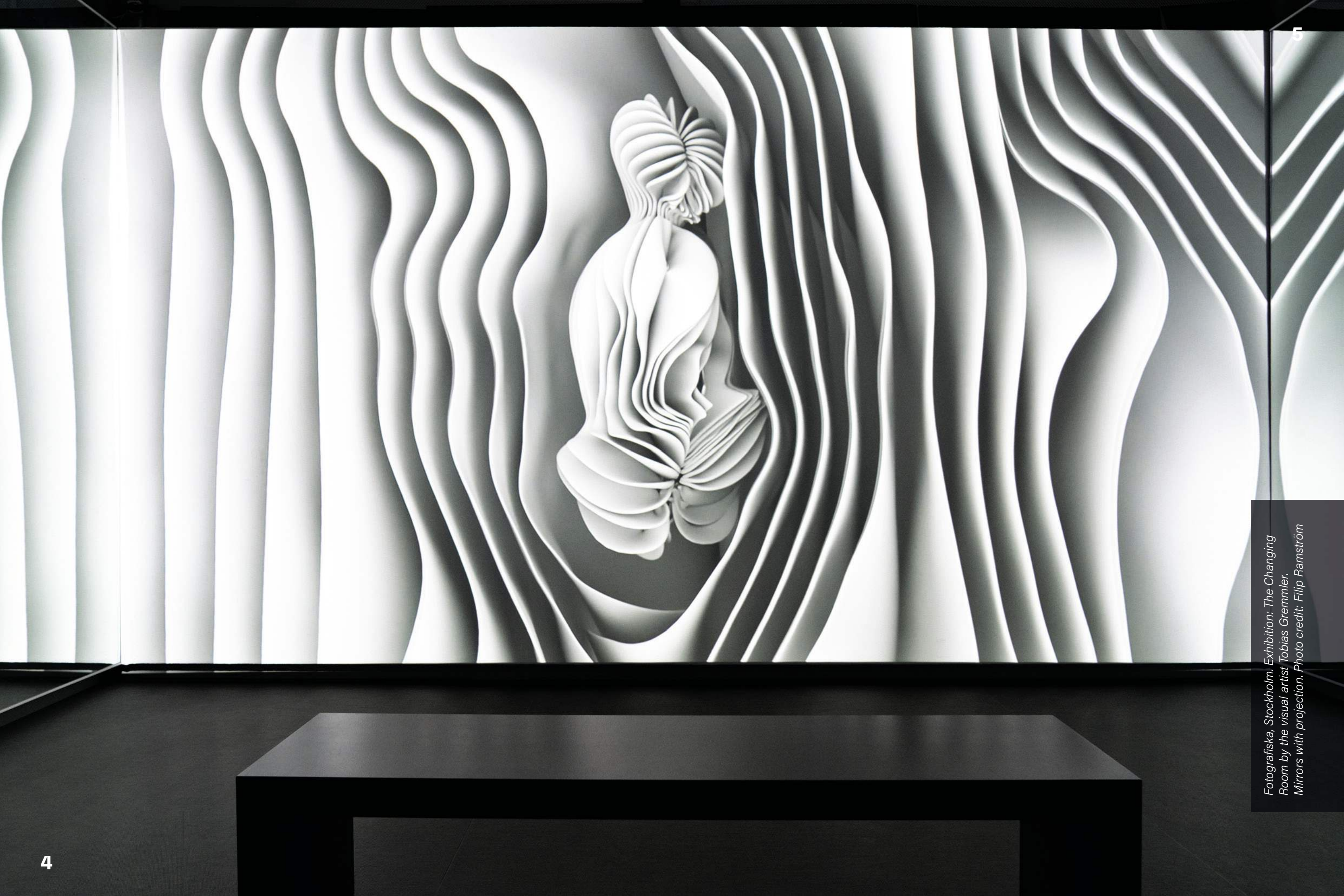
Fotografiska, Stockholm. Exhibition: The Changing Room by the visual artist Tobias Gremmler. Mirrors with projection.